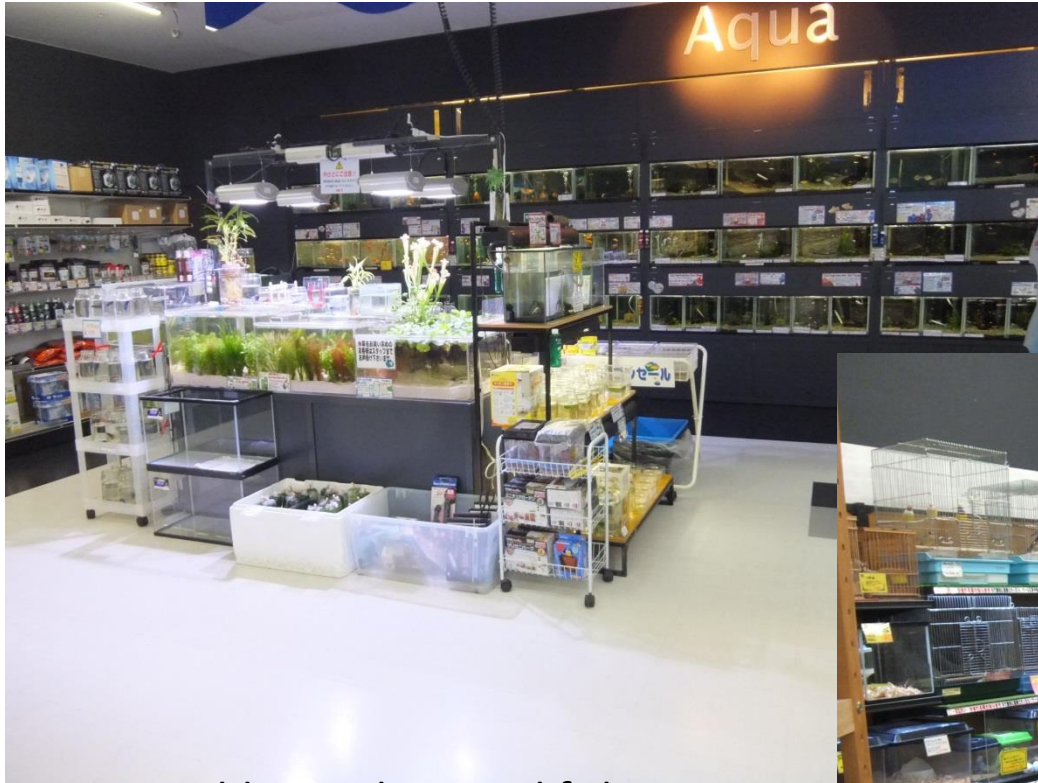
Golden and tropical fish