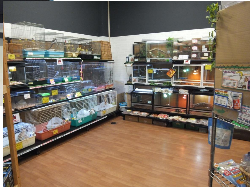
Small animals and Birds