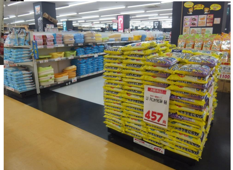
Cat Litter (Palletize display)