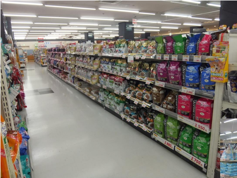
Dog Dry Food